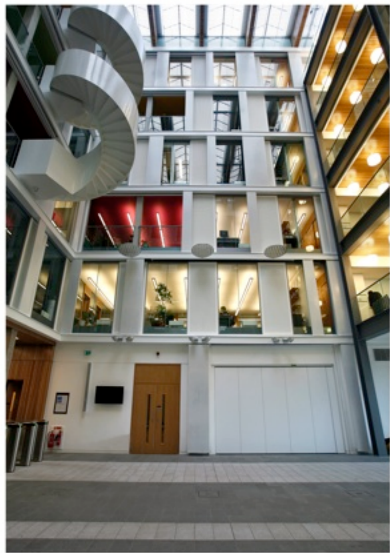
School of Informatics